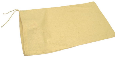
24 bags are packed into one bag to make a bundle of 25 bags.

The bags are bundled 24 into one bag with the drawstring pulled to contain 25 total bags per bundle.